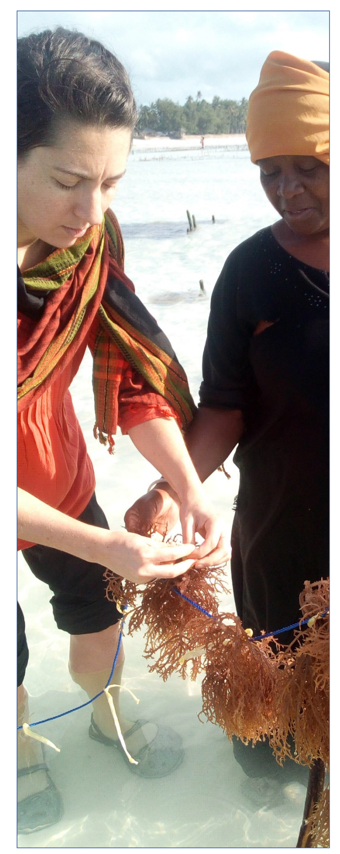
Tanzanian seaweed farmer overseeing seedlings deployment

As with any form of cultivation, the introduction and spread of seaweed pests and disease poses a major and increasing threat to production. Biosecurity helps minimise the risk of outbreaks and mitigates adverse impacts, thus protecting public health, ensuring the sustainability of the industry and safeguarding the environment. Biosecurity needs to be incorporated into government policies and regulations, as well as farm operational plans. In the context of the Progressive Management Pathway for Improving Aquaculture Biosecurity (PMP/AB), a new initiative of FAO and partners, biosecurity refers to the cost-effective management of risks posed by pathogenic agents to aquaculture through a strategic approach at enterprise, national and