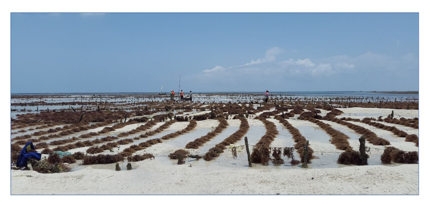
Seaweed farming in Tanzania

Such research networks would also contribute to policy improvements, alignment of policies with the One Health Aquaculture Approach, and aid countries in the implementation of national initiatives, such as the introduction of their PMP/AB-Seaweed.