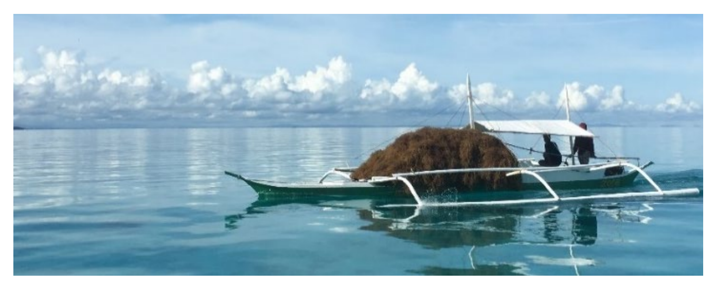
Philippine seaweed farmer with their newly harvested crop

Socio-economically, a pest or disease outbreak can have devastating economic consequences on farmers, families and their wider communities. The seaweed industry supports the livelihoods of approximately 6 million small scale farmers and processors, both women and men, in over 48 countries. Whilst high income countries are increasingly interested in cultivating seaweeds, particularly kelps, most production takes seaweed place in predominantly low- and middle- income countries, where it can make a significant contribution to incomes in impoverished coastal communities. Entire multi-generational families can be employed on seaweed farms and risk losing their livelihoods due to major pest and