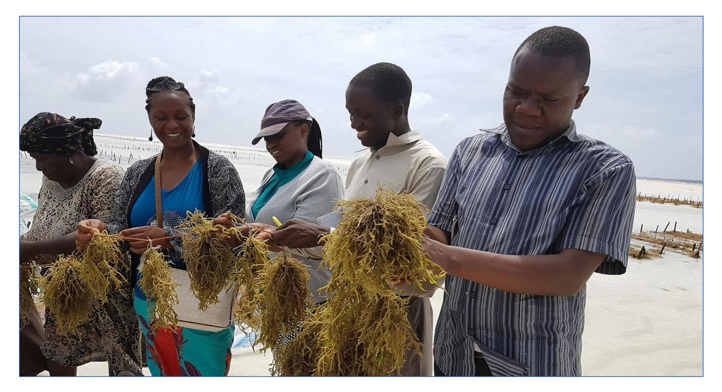
Early career researchers examine seaweed for pests and disease in Tanzania

Introduced, non-indigenous macroalgae can also alter ecosystem structure and function, by changing food webs, monopolising space, developing into ecosystem engineers, removing excessive quantities of nutrients and spreading far beyond their point of introduction, if the cultivars are allowed to escape from the farm. For example, in certain regions of the Philippines and Tanzania, only introduced farmed varieties of Kappaphycus spp and Eucheuma denticulatum can be found in the wild. The inter-breeding of farm 'escapees' with indigenous species may also lead to the impoverishment in the genetic resources of wild stocks, impacting on ecosystem resilience and reducing the potential for future breeding programmes.